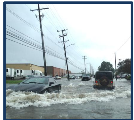
Flooding along Indianola Avenue, July 2013